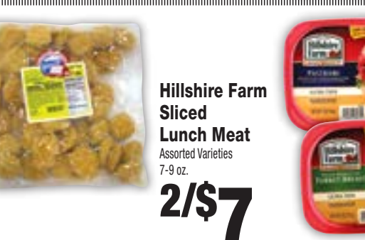
Lake Lanier Fully-Cooked Breaded Chicken 3 lb. bag