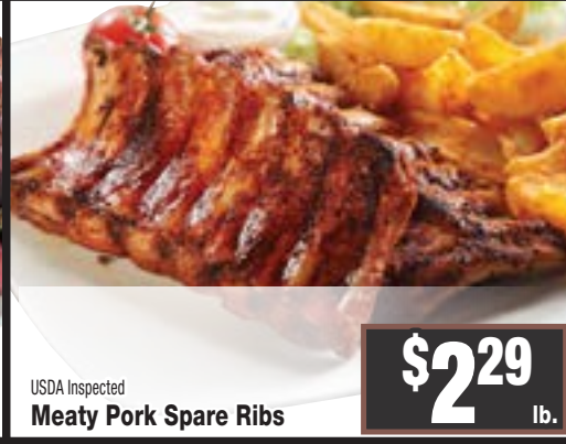
USDA Inspected Meaty Pork Spare Ribs