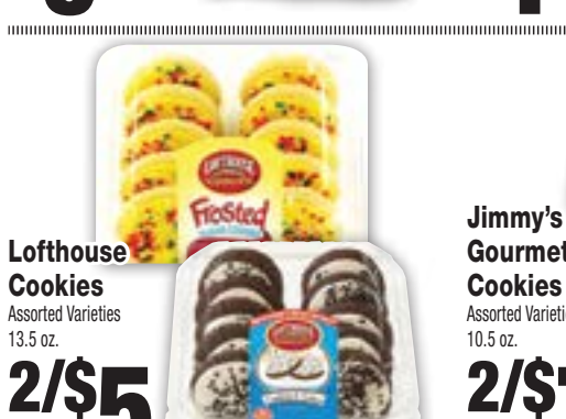
Lofthouse Cookies Assorted Varieties 13.5 oz.