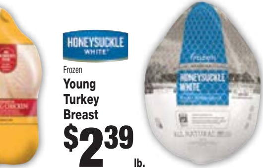
Honeysuckle White Frozen Young Turkey Breast