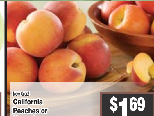
California Peaches or Nectarines