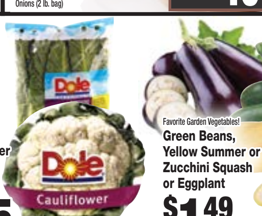
Dole Cauliflower (each) or Romaine Hearts (3 ct. pkg.)