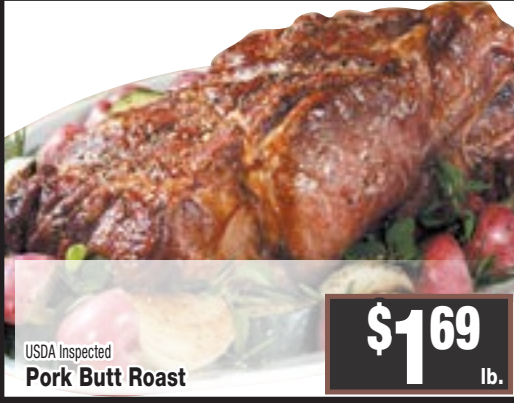
USDA Inspected Pork Butt Roast