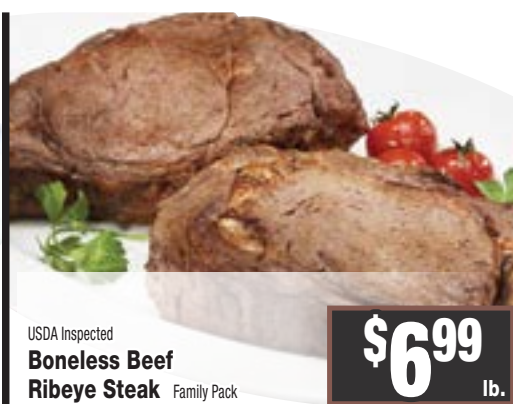
USDA Inspected Boneless Beef Ribeye Steak Family Pack