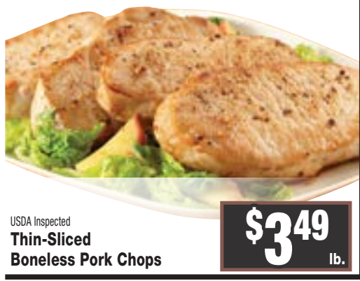
USDA Inspected Thin-Sliced Boneless Pork Chops