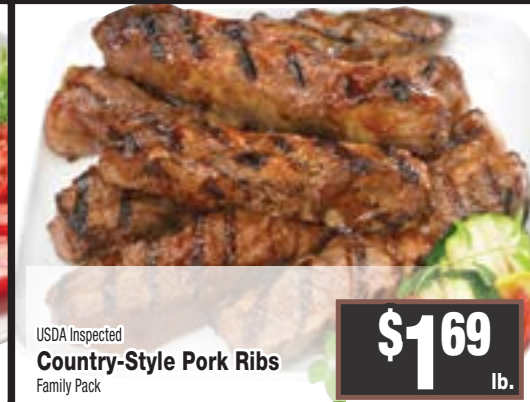
USDA Inspected Country-Style Pork Ribs Family Pack