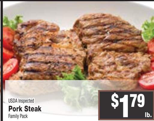
USDA Inspected Pork Steak Family Pack