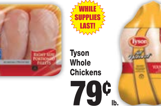
Tyson Boneless Chicken Breast Tray Pack