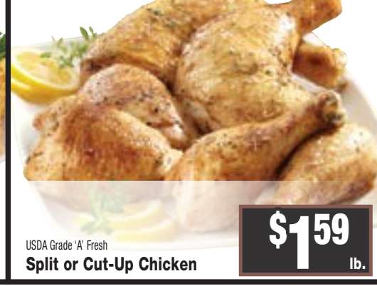
USDA Grade 'A' Fresh Split or Cut-Up Chicken