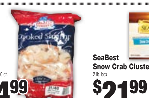
Pacific Dynasty Cooked Shrimp 2 lb. bag • 31-40 ct.