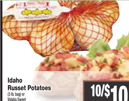
Idaho Russet Potatoes (3 lb. bag) or Vidalia Sweet Onions (2 lb. bag)