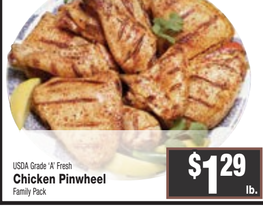
USDA Grade 'A' Fresh Chicken Pinwheel Family Pack