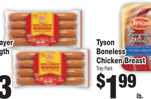
Oscar Mayer Bun Length Wieners 16 oz.