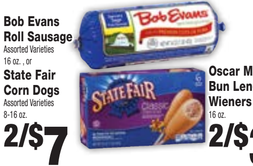
Bob Evans Roll Sausage Assorted Varieties 16 oz., or State Fair Corn Dogs Assorted Varieties 8-16 oz.