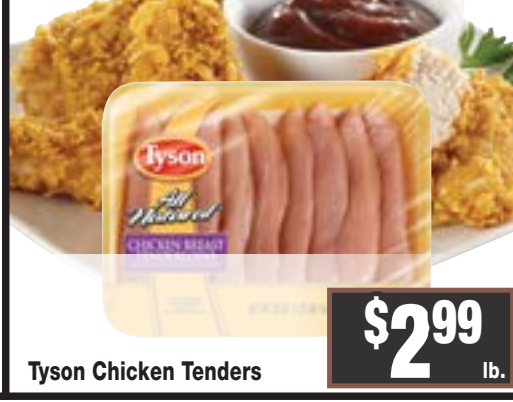
Tyson Chicken Tenders