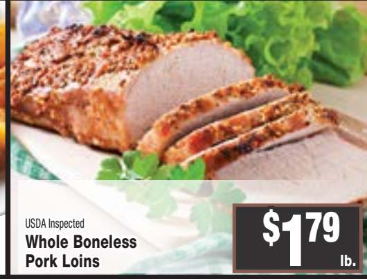
USDA Inspected Whole Boneless Pork Loins