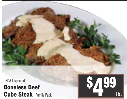
USDA Inspected Boneless Beef Cube Steak Family Pack