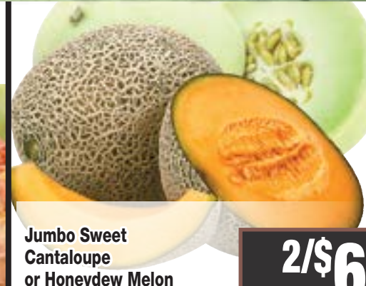
Jumbo Sweet Cantaloupe or Honeydew Melon each