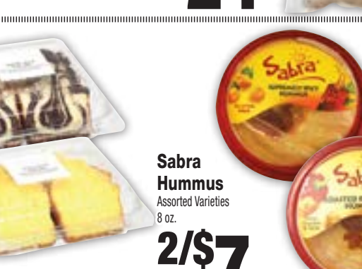
Sliced Loaf Cakes Assorted Varieties 16 oz.