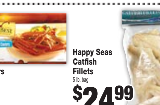
SeaBest Snow Crab Clusters 2 lb. box