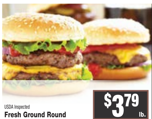
USDA Inspected Fresh Ground Round