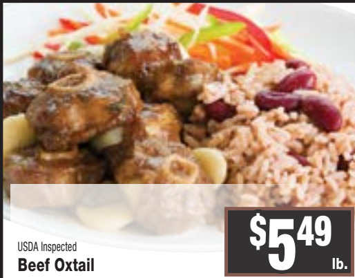
USDA Inspected Beef Oxtail