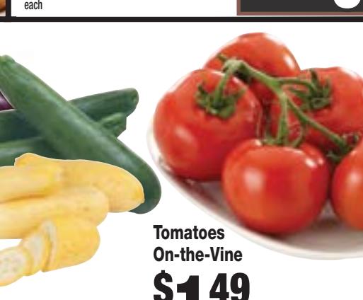
Favorite Garden Vegetables! Green Beans, Yellow Summer or Zucchini Squash or Eggplant