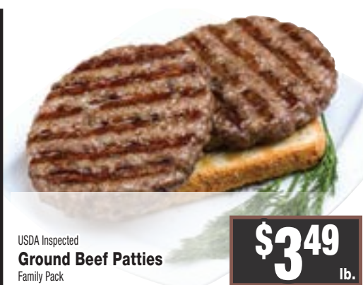
USDA Inspected Ground Beef Patties Family Pack