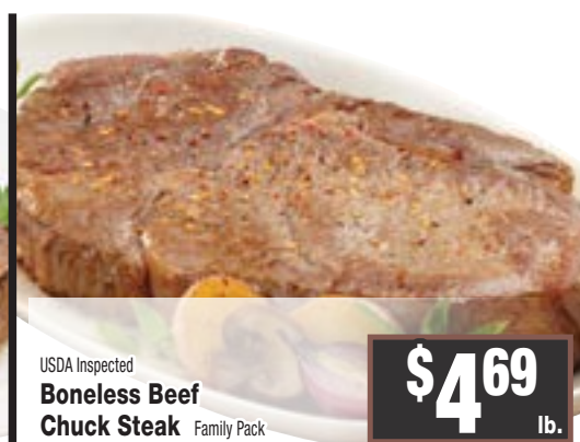
USDA Inspected Boneless Beef Chuck Steak Family Pack