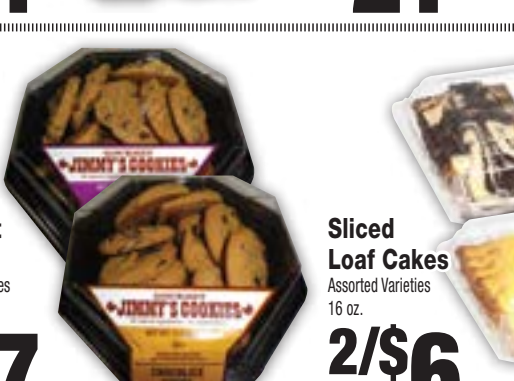
Jimmy's Gourmet Cookies Assorted Varieties 10.5 oz.