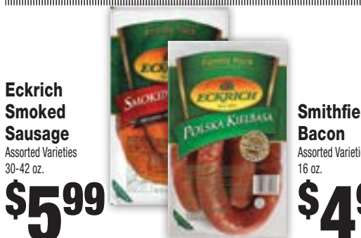
Eckrich Smoked Sausage Assorted Varieties 30-16 oz.