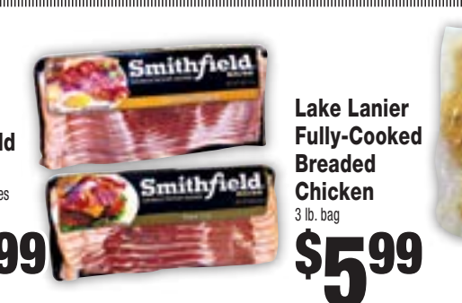
Smithfield Bacon Assorted Varieties 16 oz.