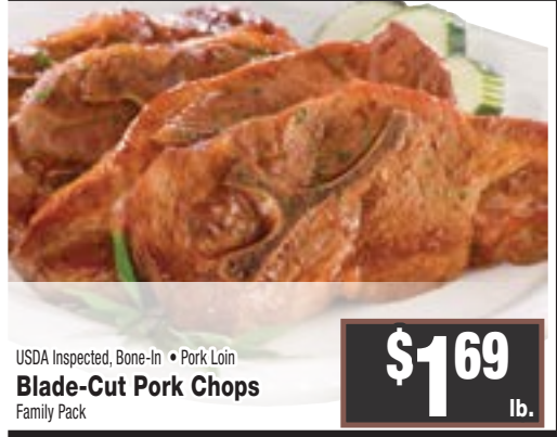
USDA Inspected, Bone-In • Blade-Cut Pork Chops Family Pack