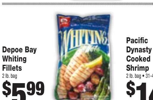
Depoe Bay Whiting Fillets 2 lb. bag