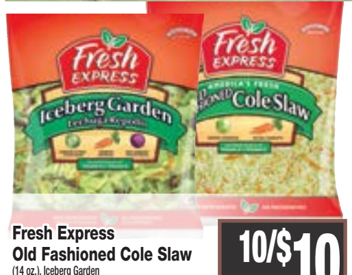
Fresh Express Old Fashioned Cole Slaw (14 oz.), Iceberg Garden Salad (12 oz.) or Shredded Iceberg Lettuce (8 oz.)